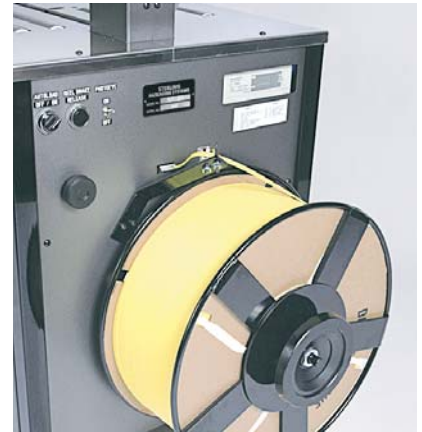
Waist-high, Automatic Strap Loading Simple Diagnostics