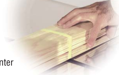
Great for wood molding or trim.