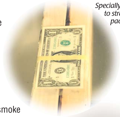
Specially designed to strap narrow packages.