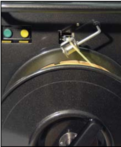
Push Button Auto Load