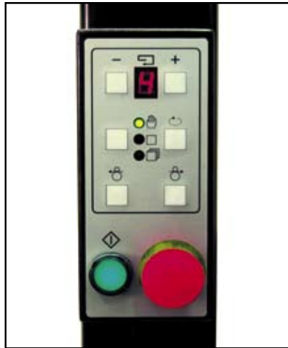
Movable Magnetic Pendant